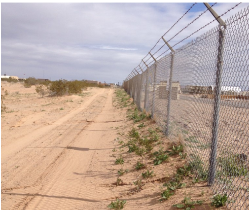
Sahara mustard infestation between roadway and fence line.

Two commonly found invasive plants on the range are Sahara mustard ( Brassica tournefortii ) and buffelgrass ( Pennisetum cillare ). Both species are native to the Old World, where they are common in North Africa and the Middle East. Both are drought-tolerant and well suited for the extreme desert environment of the BMGR-W. In addition to displacing native plants that are important to local wildlife, buffelgrass, and to a lesser extent, Sahara mustard, bring a relatively new fire potential to the Sonoran Desert. Fires carried by non-native plants can destroy important habitat and pose significant threats to military training areas and structures.